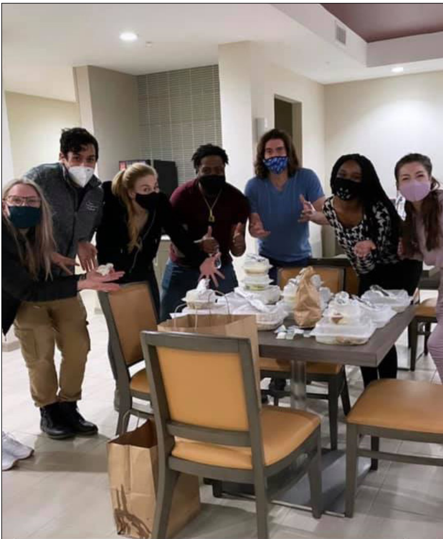
Big THANK YOU to the TSF Guild for providing dinner for the roadshow company. ❤️